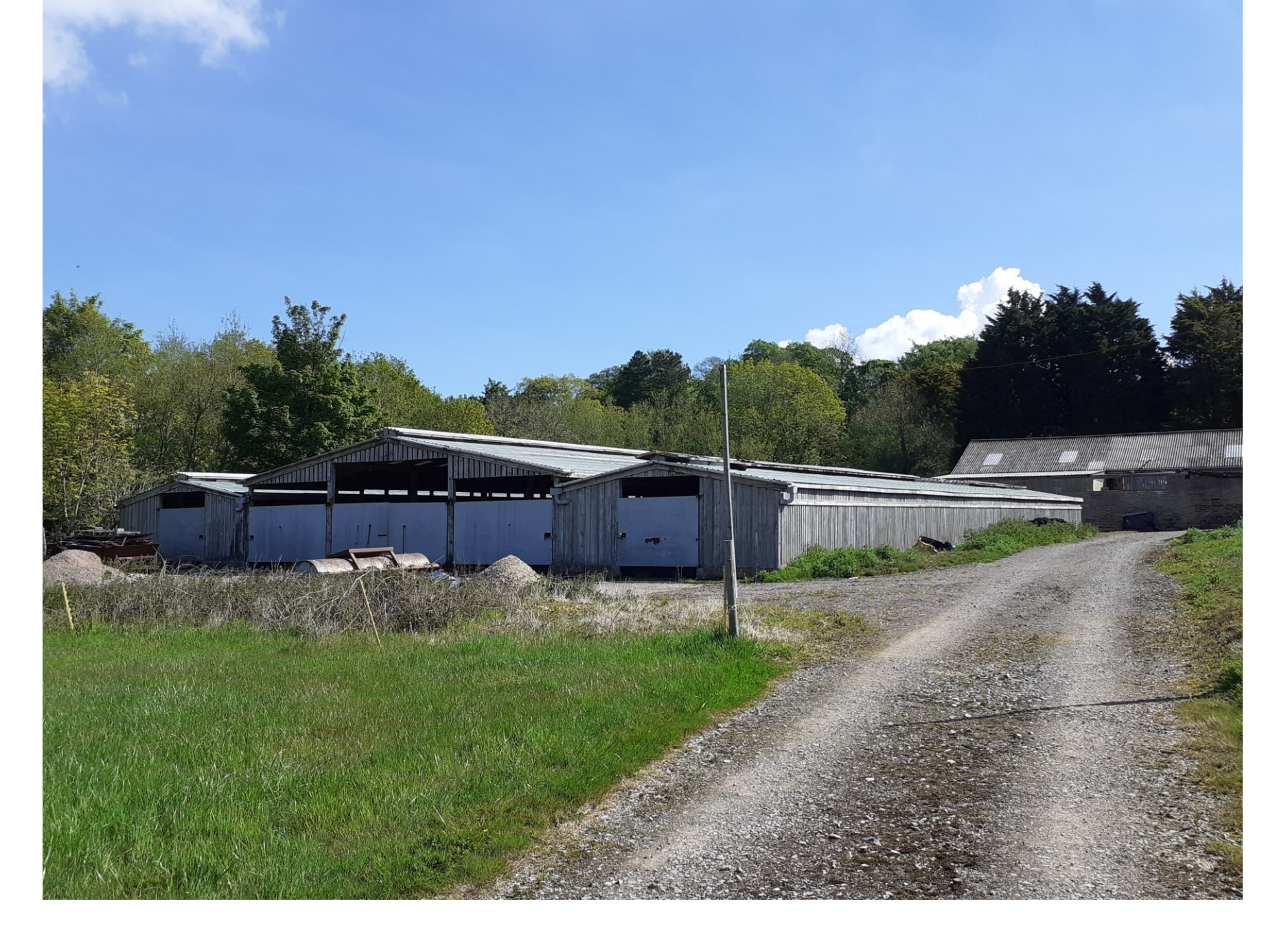
Building C (west and south) elevations viewed from access track