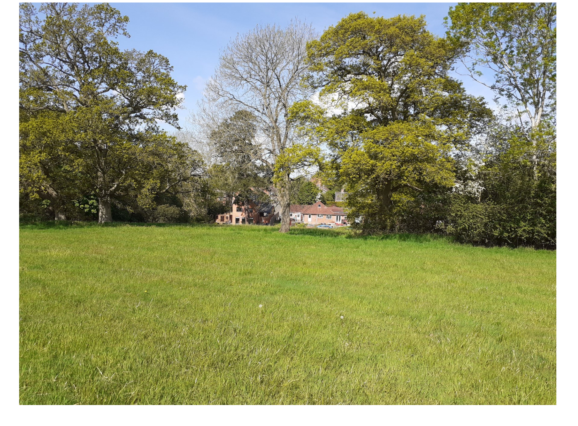
View from track to houses in Corner Mead