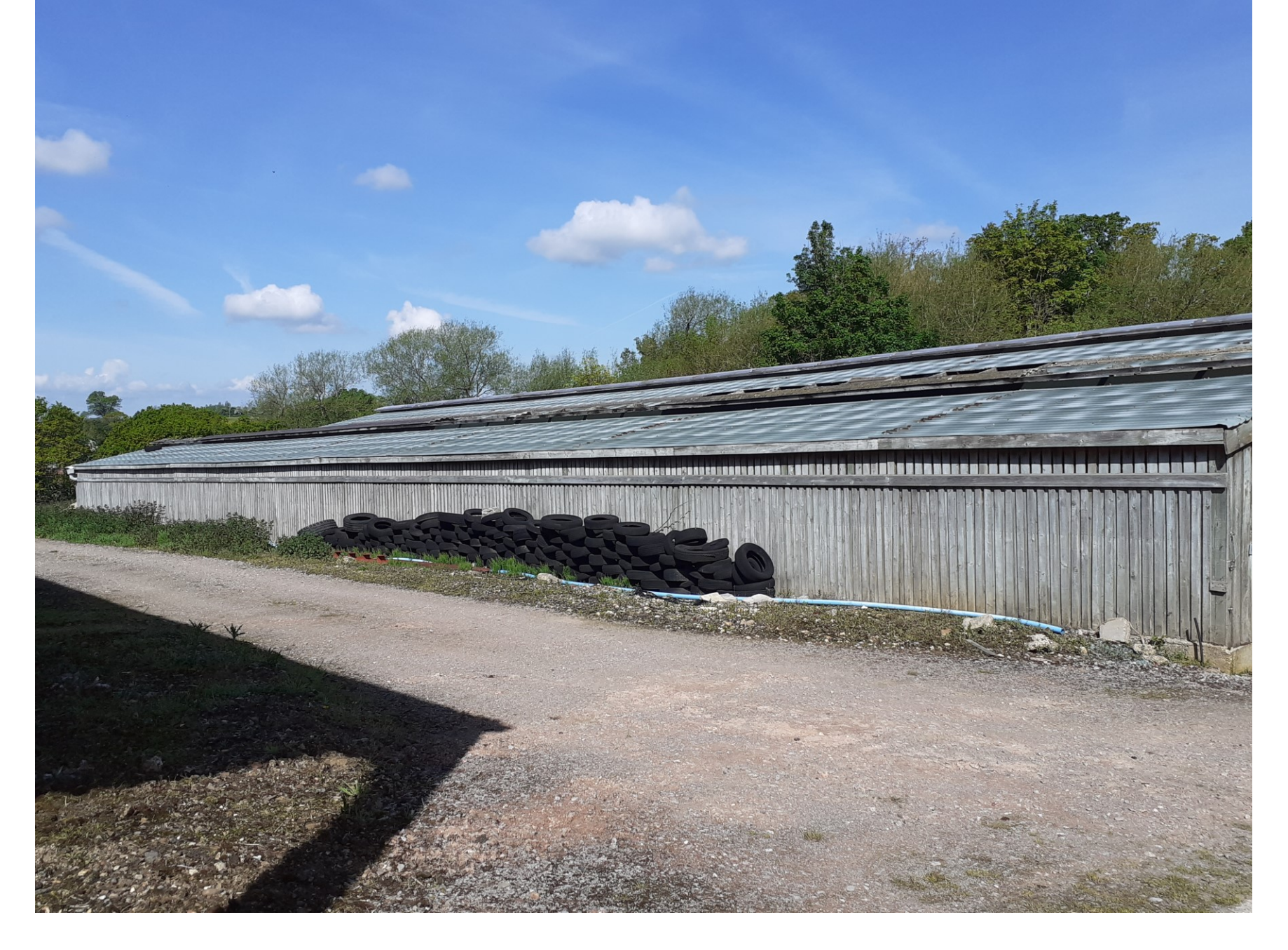
South (front) elevation of Building C