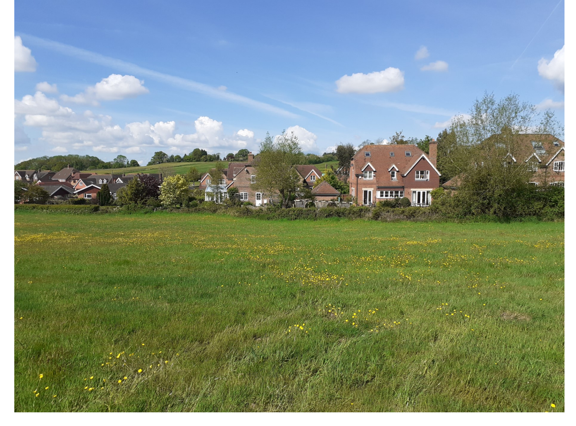
View of houses on Cold Ash Hill from the access track