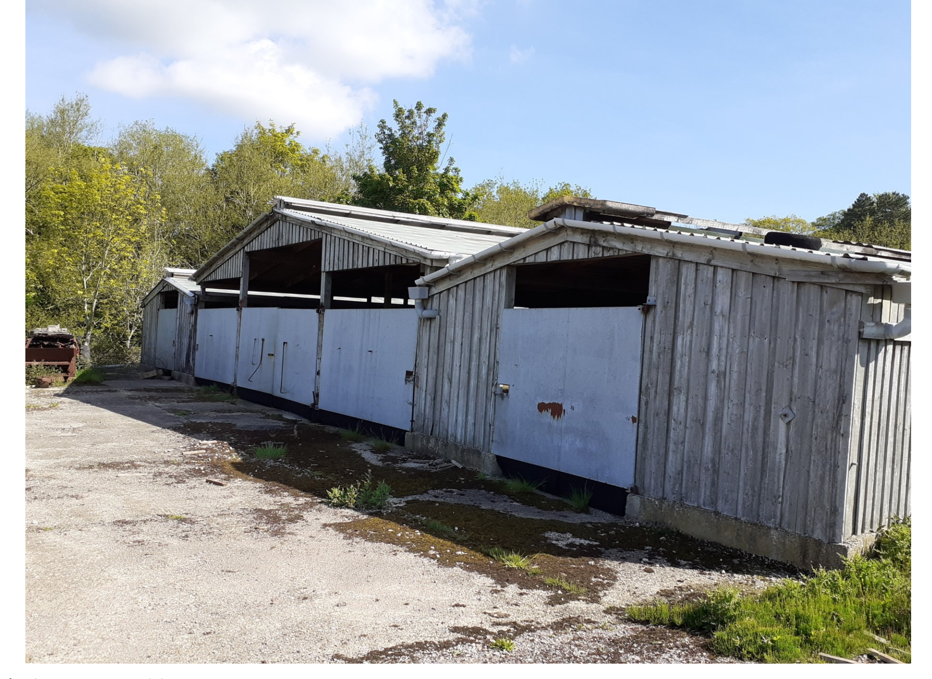
Side (west) elevation Building C