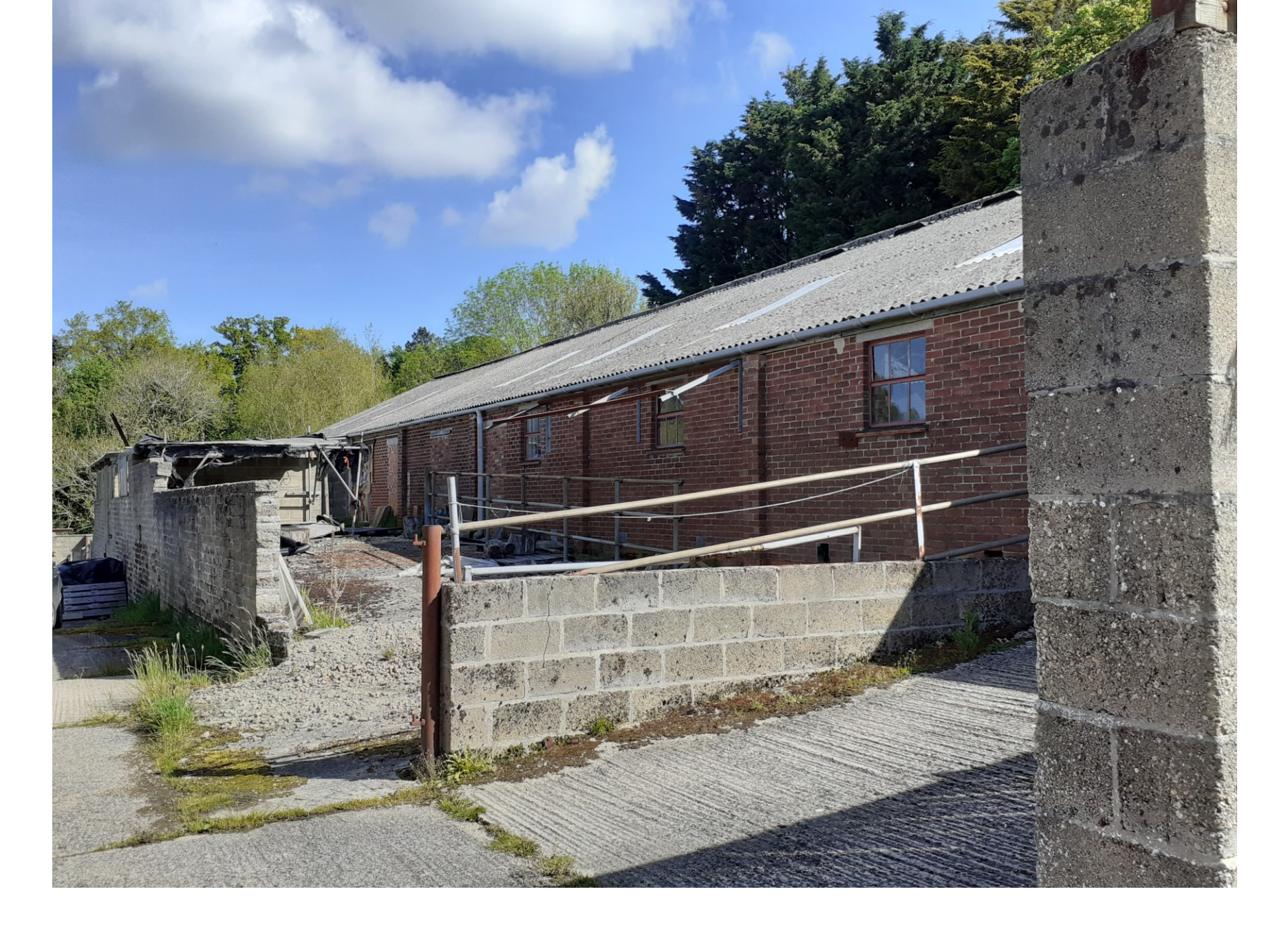
West (front) Elevation of Building A