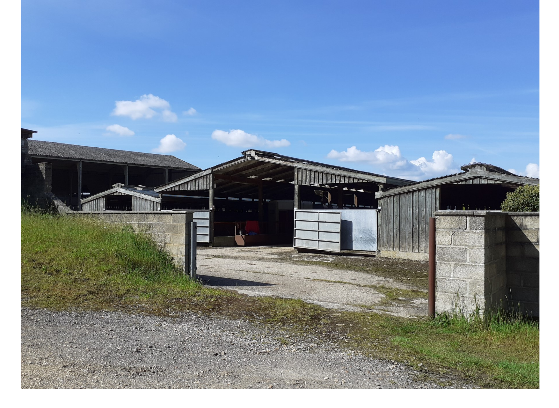
Side (east) elevation of Building C