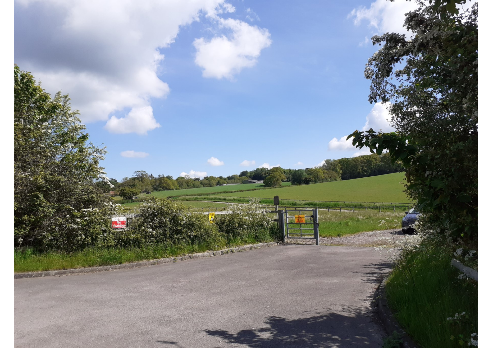
View of site from access on Cold Ash Hill