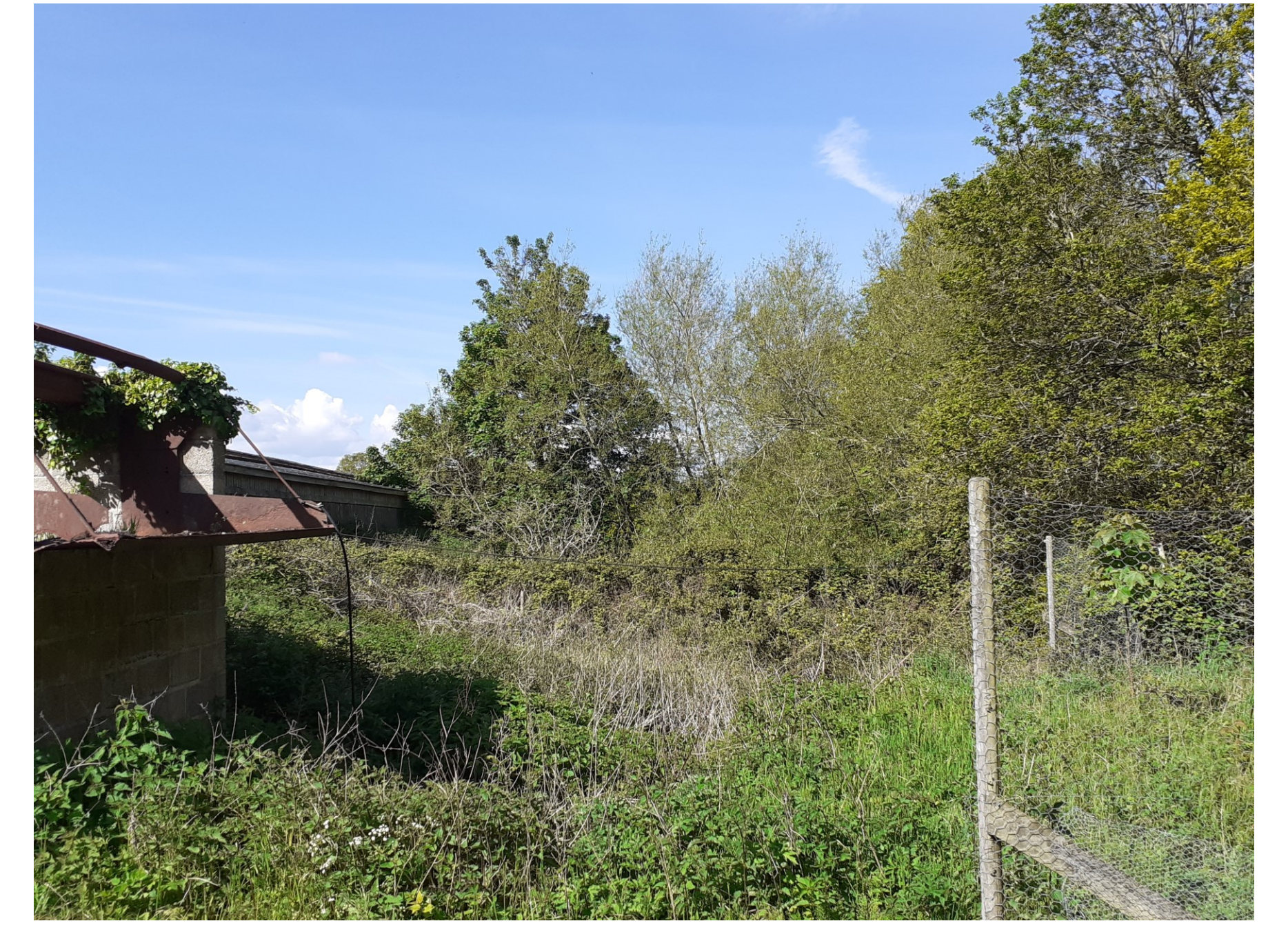
View across slurry pits to the north of Building C