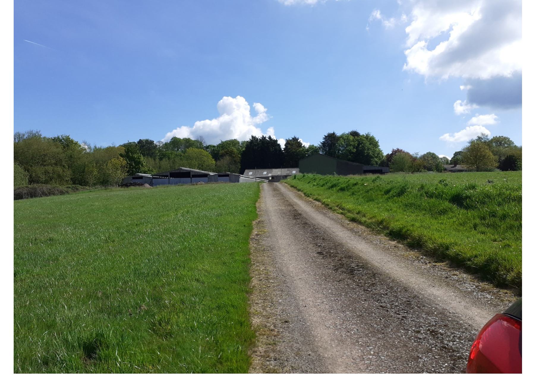
View of site from access track