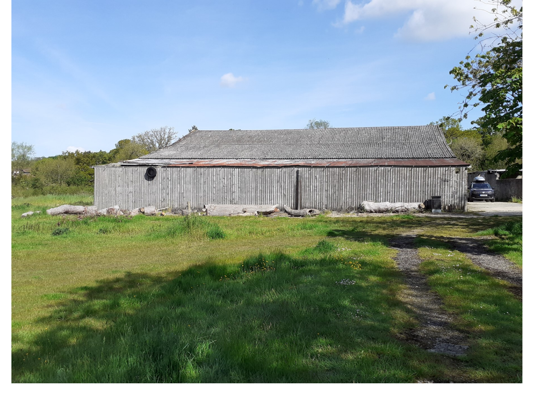
View of Building B (to be demolished) from the south