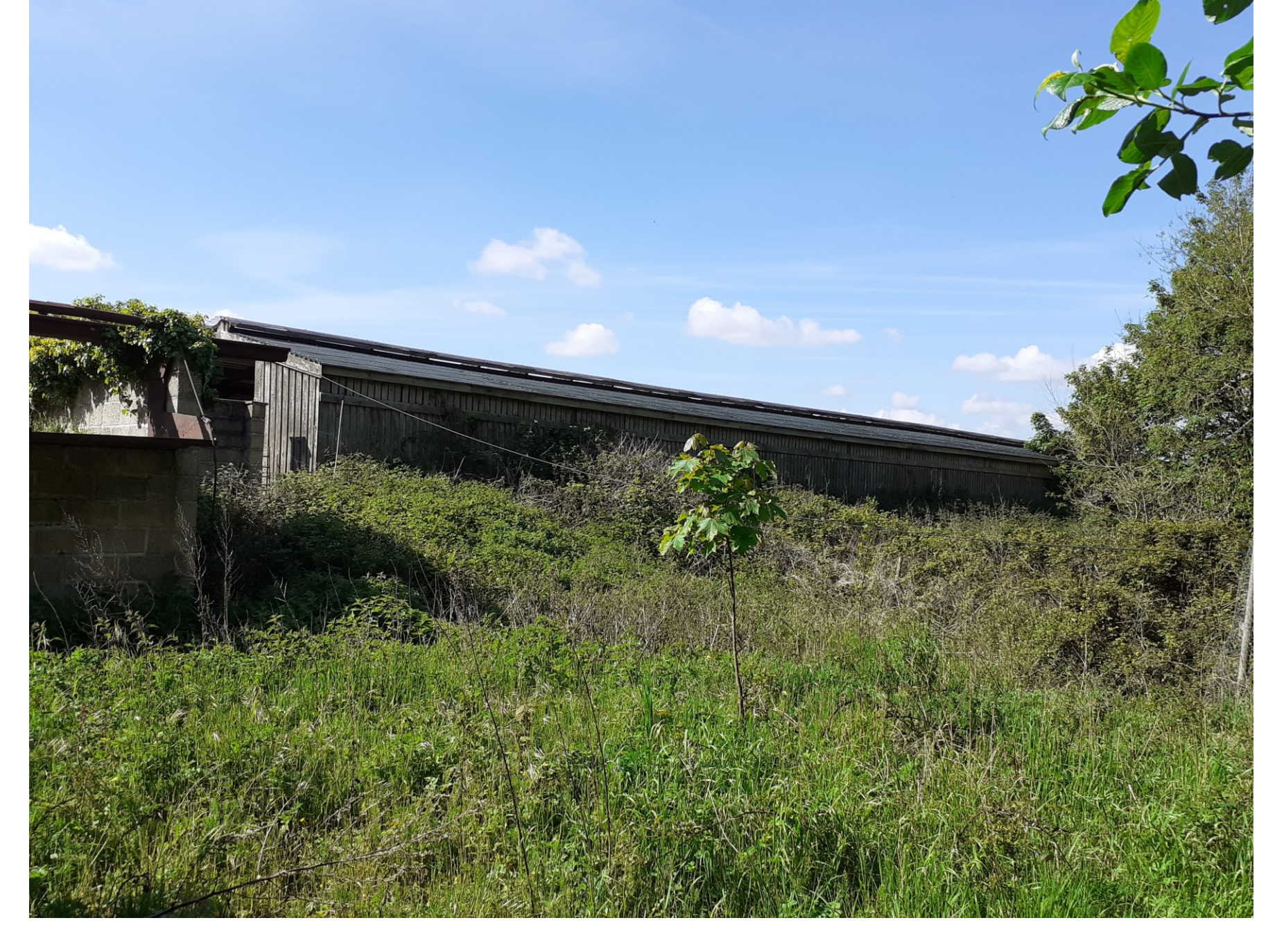
North (rear) elevation of Building C