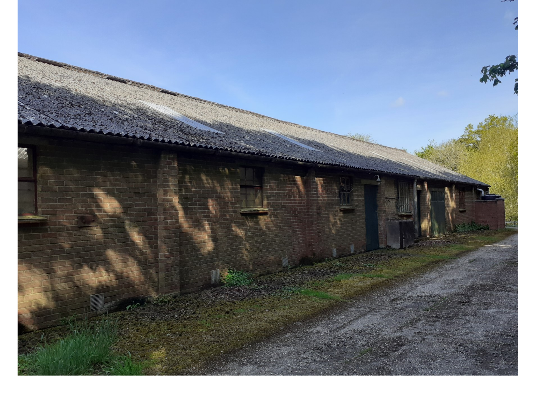
Rear (east) elevation of Building A