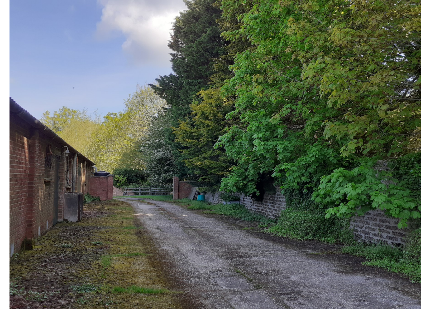
Rear (east) elevation of Building A and eastern site boundary