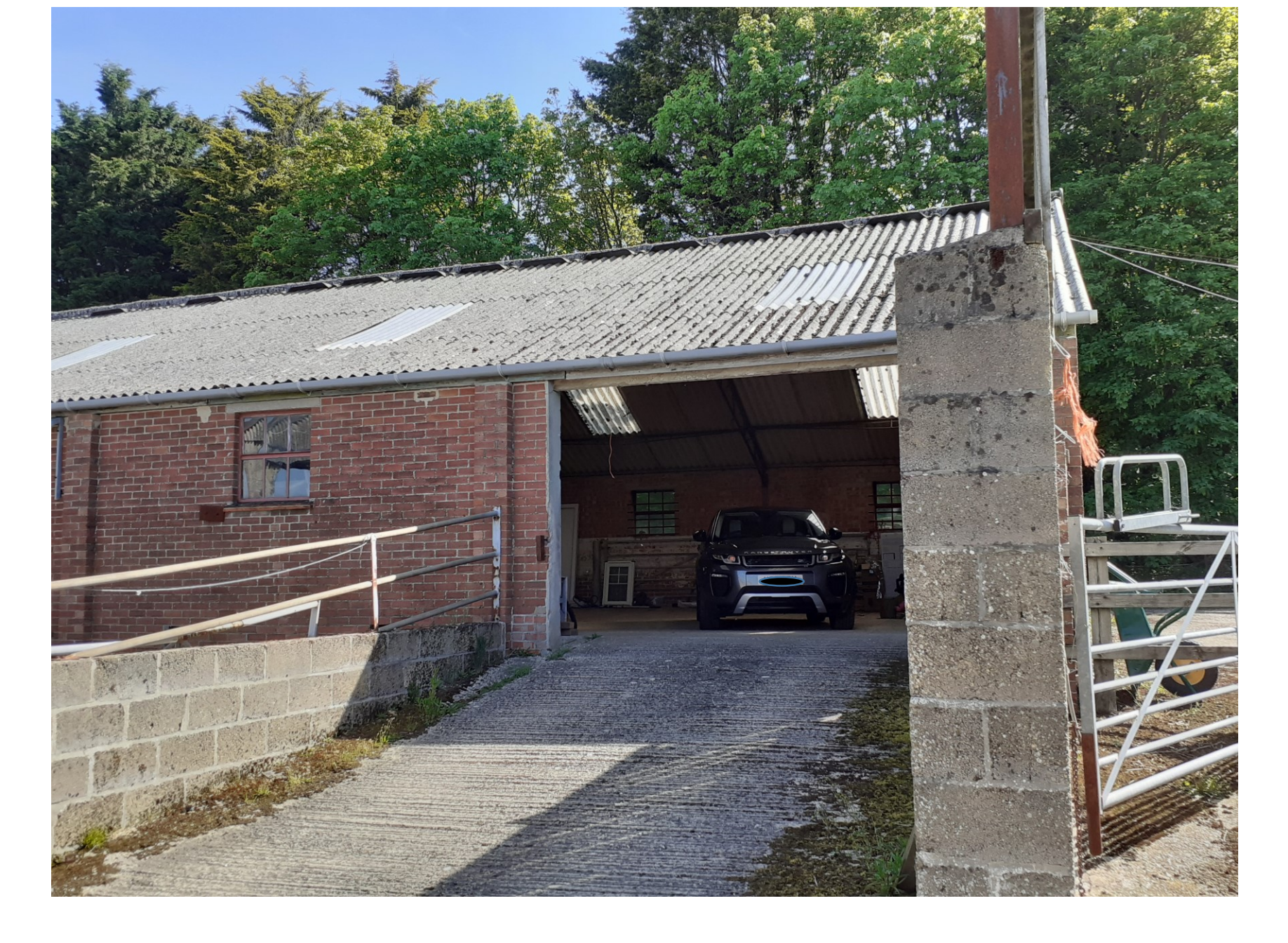
West (front) elevation of Building A