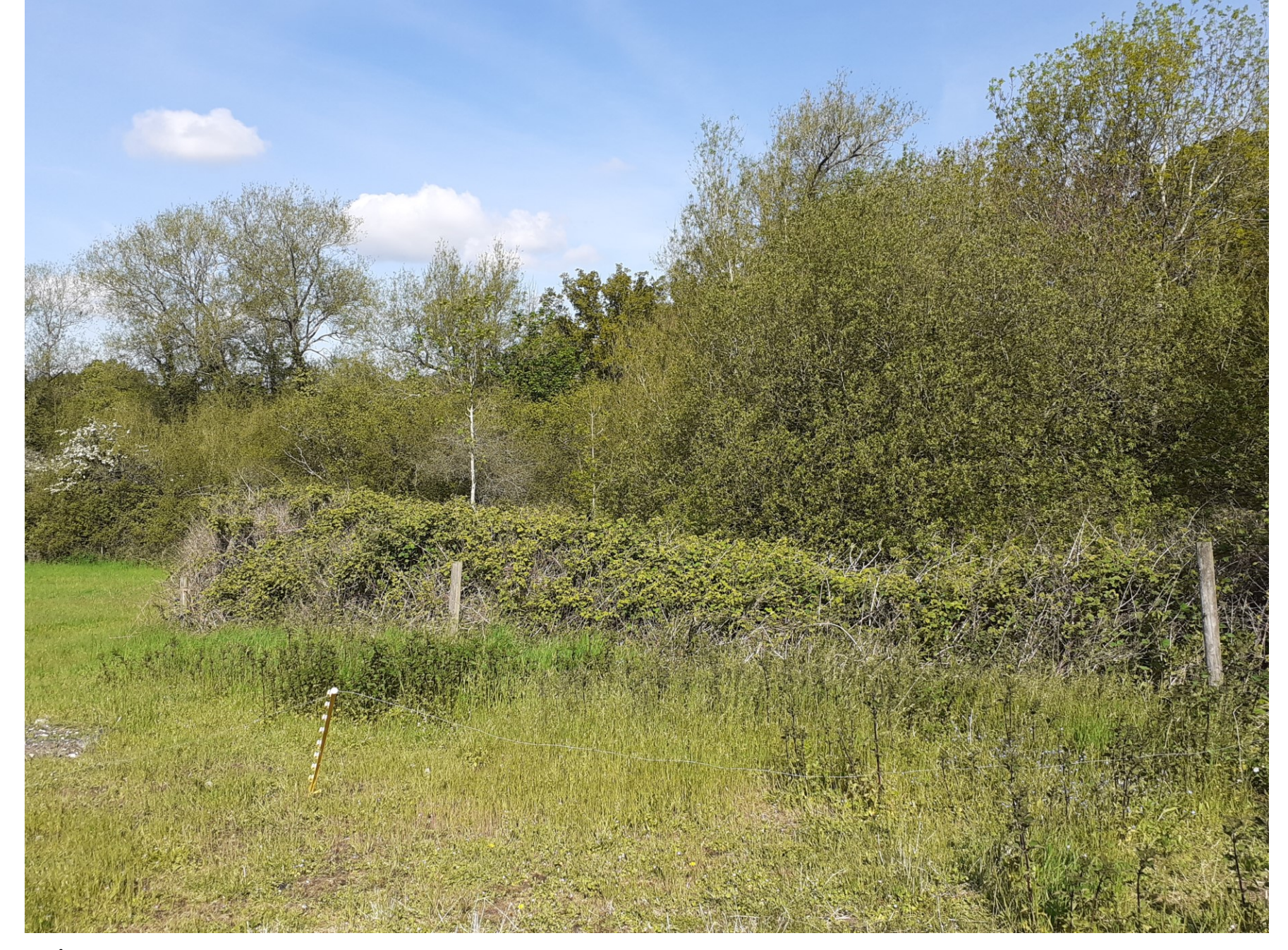
Location of pond