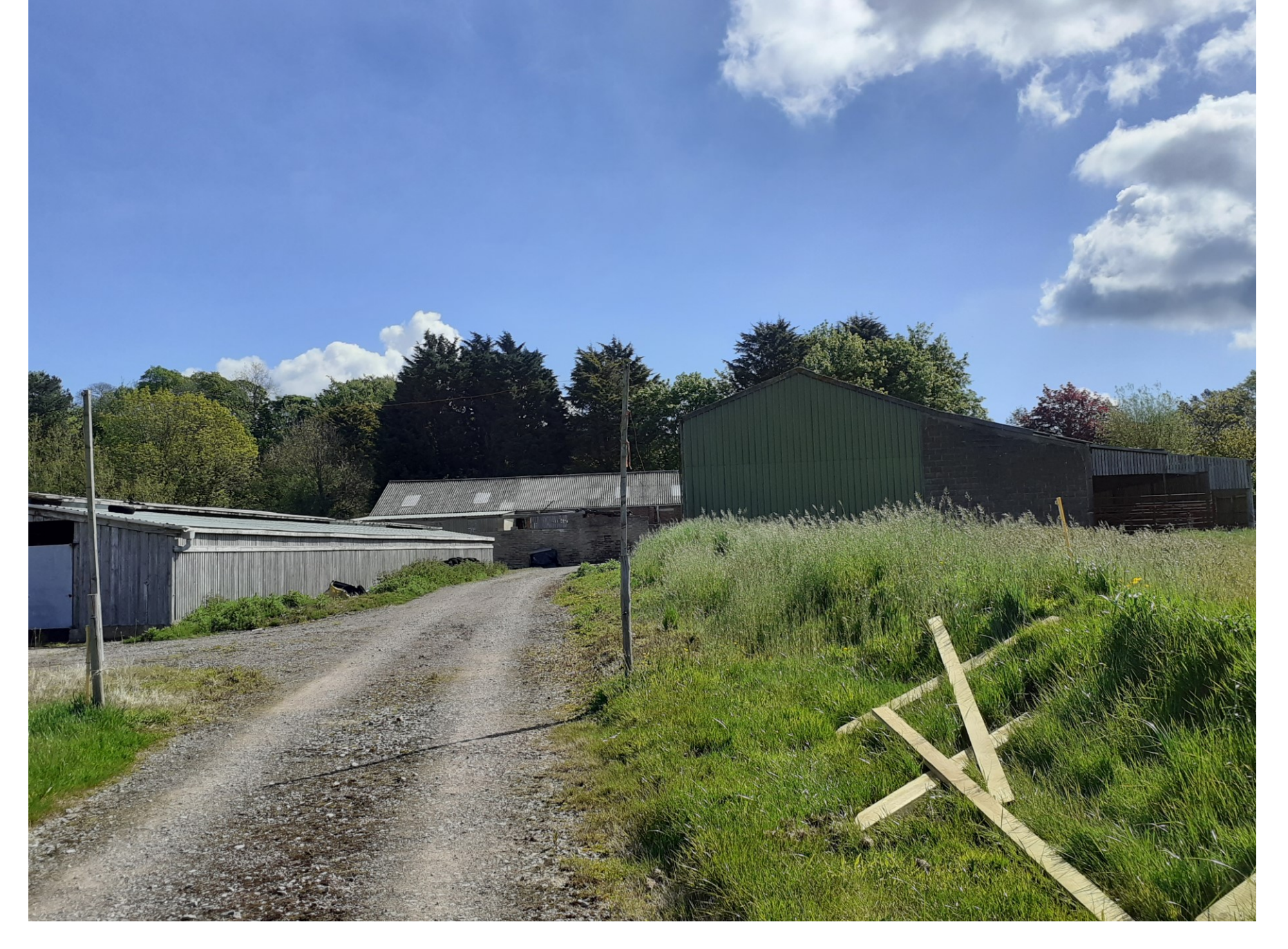
Building C south elevation, Building A west elevation and Building B (to be demolished)