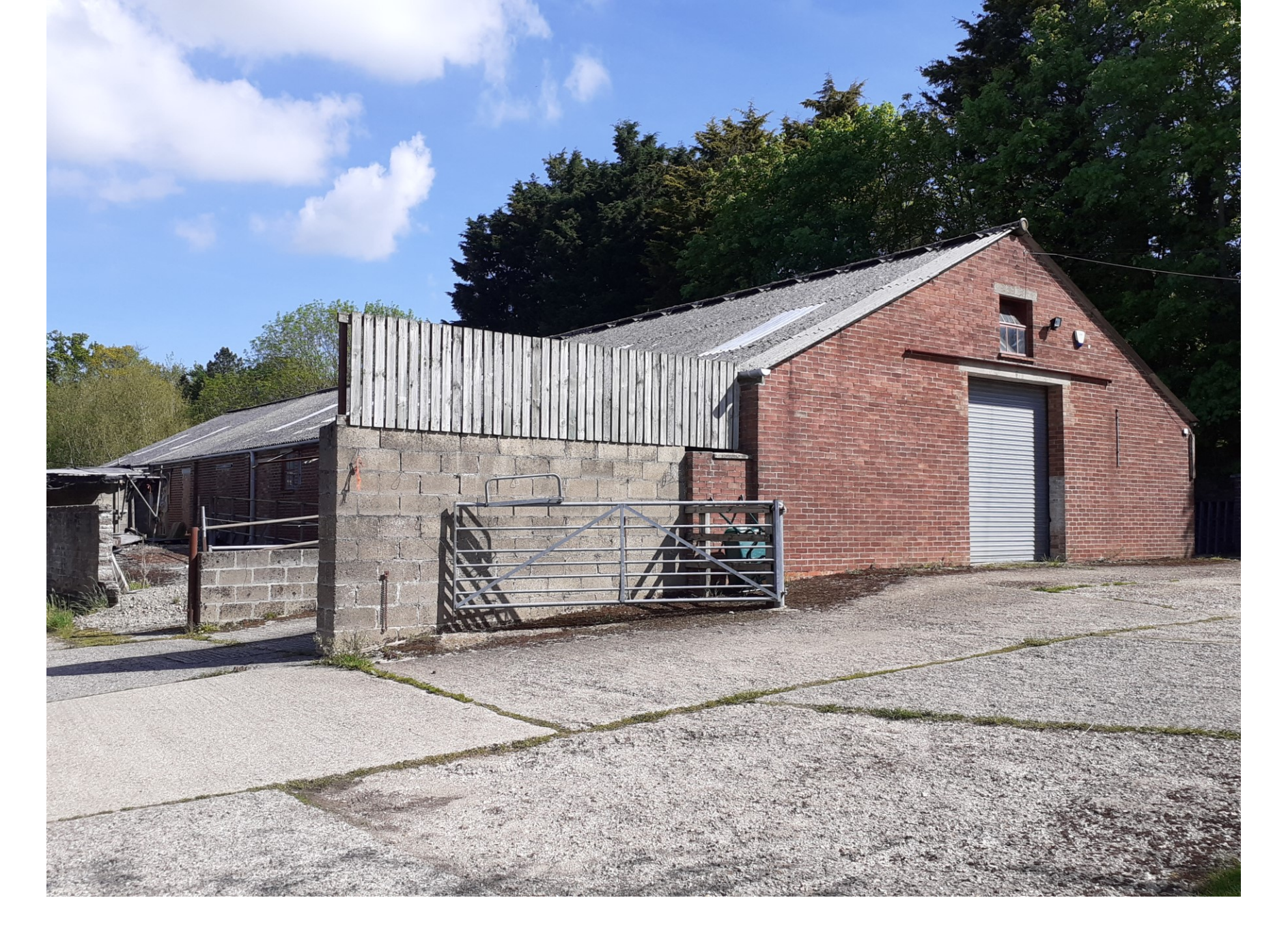
South elevation of Building A